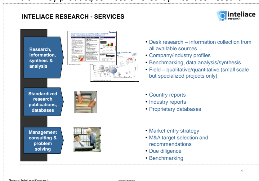
Exhibit 2: Key product/services offered by Inteliace Research